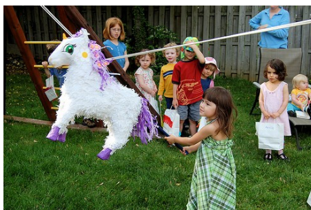
Hitting a piñata is popular at Hispanic celebrations.